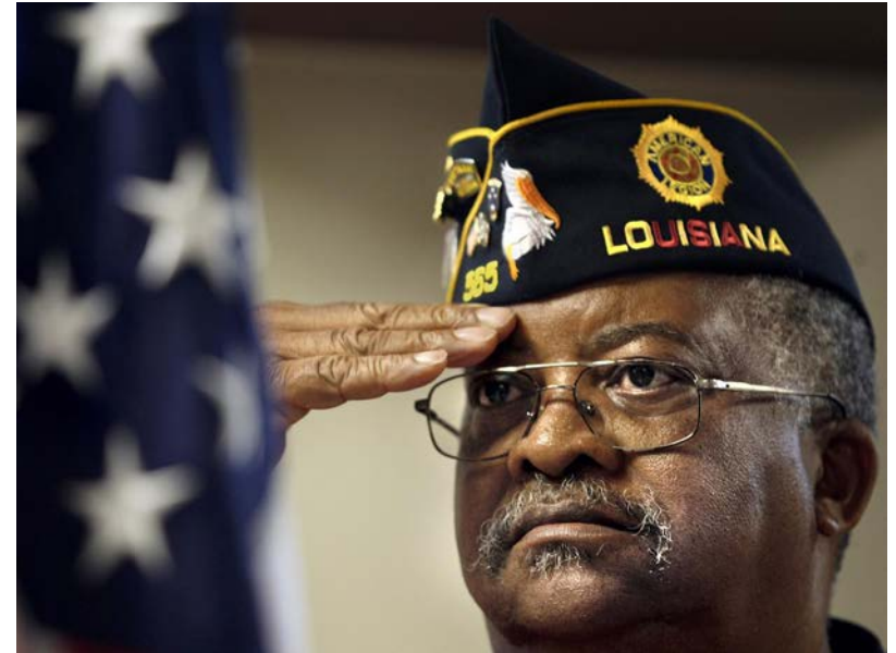
A Vietnam veteran salutes the flag during a Veterans Day program.