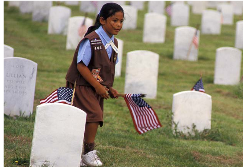
A Brownie places U.S. flags at veterans' graves in a Los Angeles cemetery.