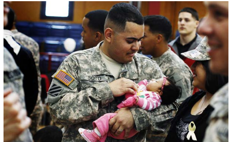
A soldier holds his daughter after his return from Iraq.

Even when vets choose to serve, their life isn’t often easy. Whether or not they face combat, they are often stationed overseas. While this can be an adventure, it also means they must leave behind family and friends for months, even years. They miss birthdays and graduations. Sometimes babies are born while families are apart.