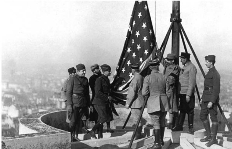
An American flag is raised near Paris to celebrate the armistice and end of World War I on November 11, 1918.