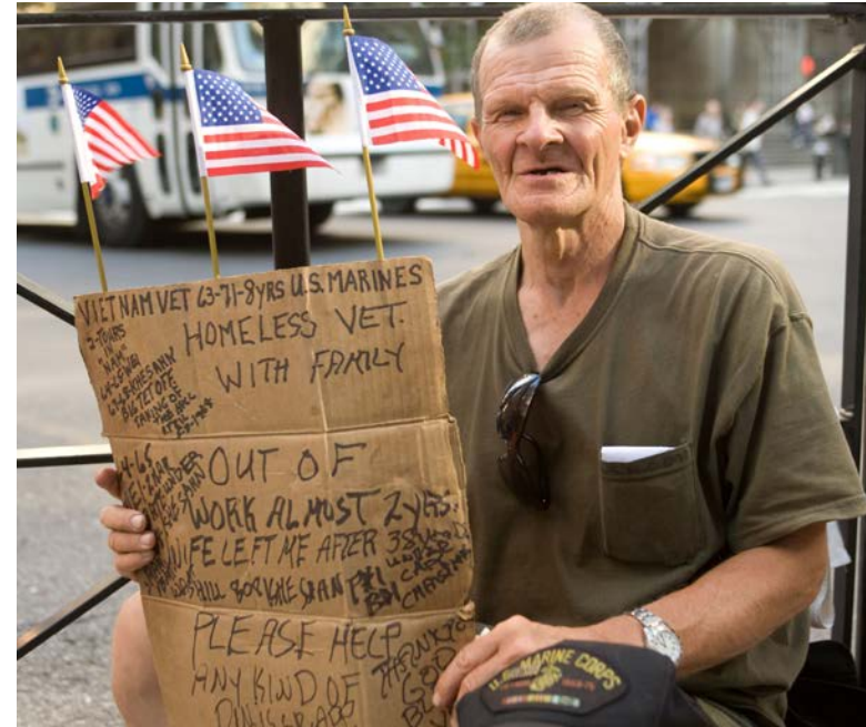
A Vietnam War veteran and former U.S. marine asks for help in New York City.