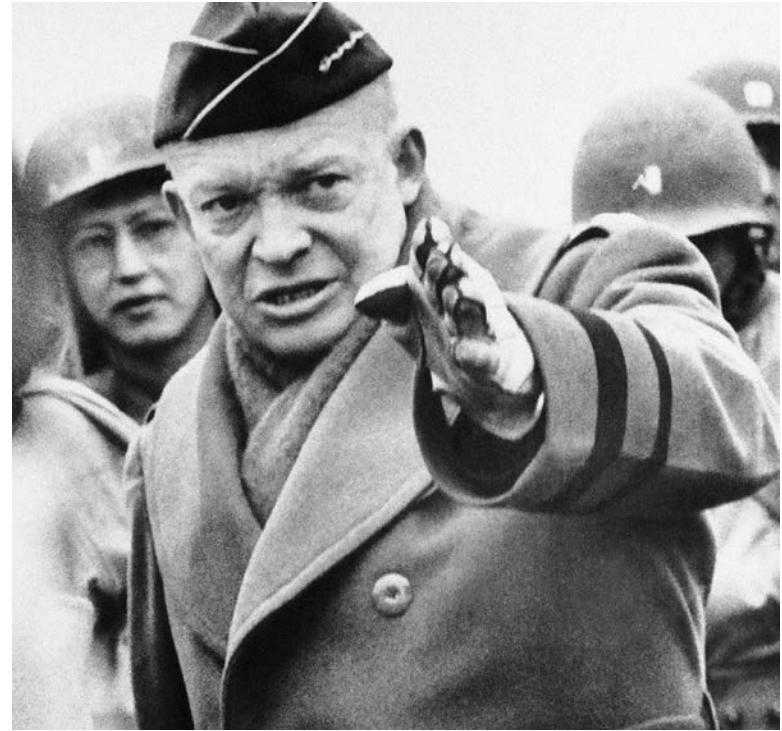
General Dwight D. Eisenhower gestures as he watches troops and tanks in Great Britain on March 13, 1944.

The sacrifices that the United States and its allies made were huge. After the war, many Americans started to call for recognition of World War II veterans. In fact, they wanted all veterans to be honored, not just those who fought in wars.