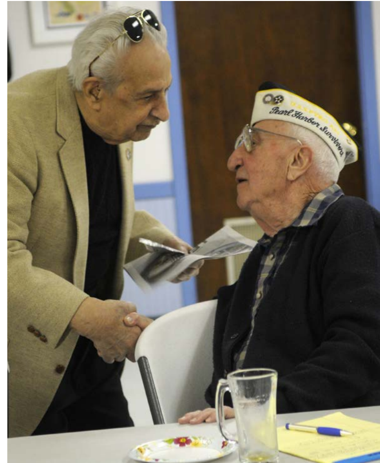
Two Pearl Harbor survivors greet each other.

Soldiers who have seen combat are sometimes diagnosed with post-traumatic stress disorder . It can come in the form of depression, anger, grief, fear, or guilt. The victims may suffer many different symptoms. Because of their experiences with gunfire and explosions, some veterans may be bothered by loud noises.