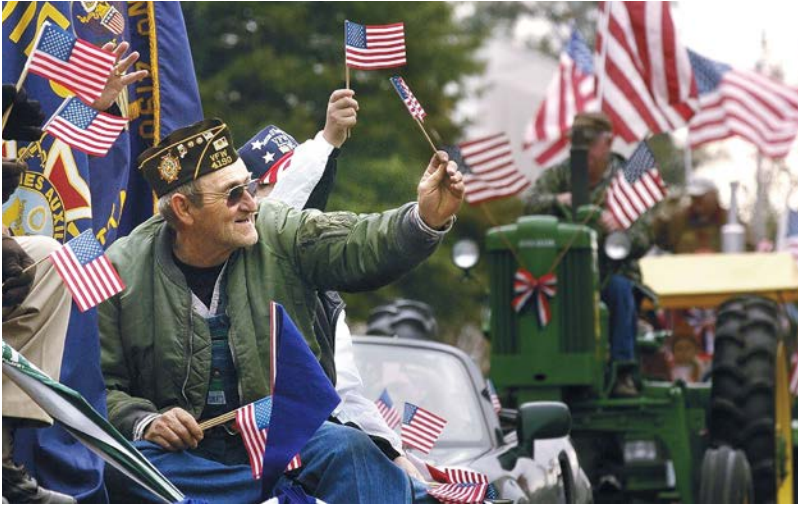
A member of the Veterans of Foreign Wars waves flags during an annual Veterans Day parade.

On Veterans Day, the president or vice president lays a wreath on the Tomb of the Unknown Soldier. Laying a wreath or flowers on a tomb or headstone at a cemetery is one way to honor people who have died.