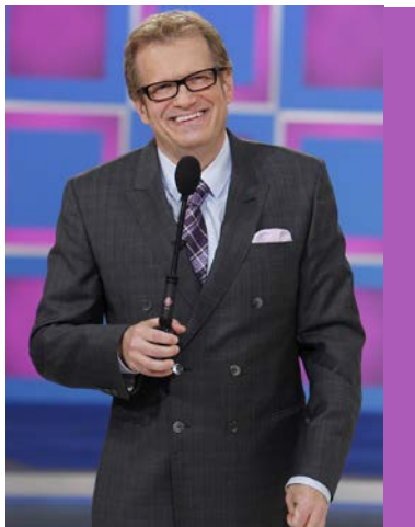
Drew Carey, host of The Price Is Right , is a former U.S. marine.