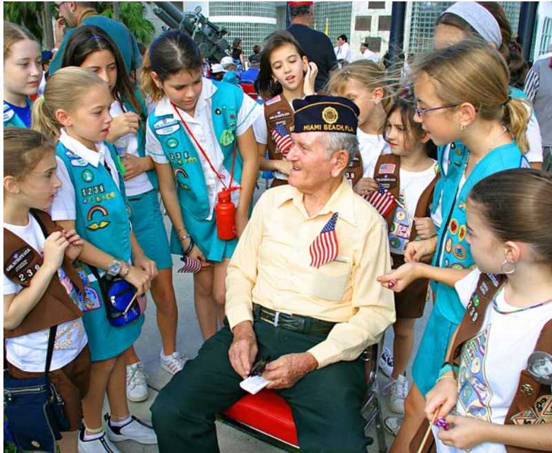
A veteran talks to Brownies and Girl Scouts at a Veterans Day parade.