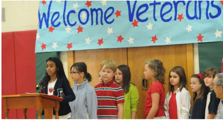
Fourth graders recite facts about Veterans Day.