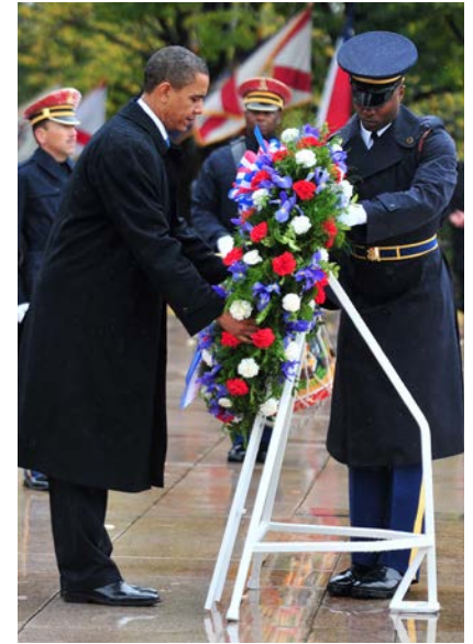
President Barack Obama lays a wreath at the Tomb of the Unknown Soldier.

Sometimes there are very few remains of a soldier's body. Some soldiers' bodies are never found. After World War I, the British decided to create a tomb for an unknown soldier. The United States did the same. An American soldier killed in France during World War I could not be identified. On November 11, 1921, the soldier was buried in the Tomb of the Unknown Soldier at Arlington National Cemetery. Since then, an unidentified soldier from every war in which the United States fights has been buried there.