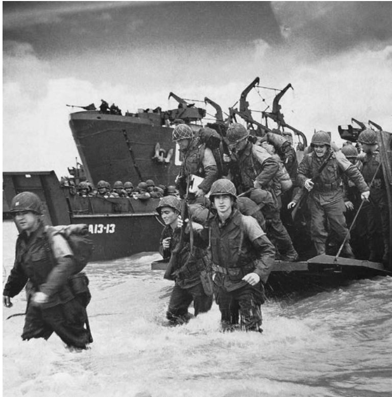
American soldiers land on the French coast on June 6, 1944.

In September 1939, war broke out in Europe again. Even more soldiers were sent to fight, and more soldiers were killed than in the Great War. People later called this war World War II and then referred to the Great War as World War I.