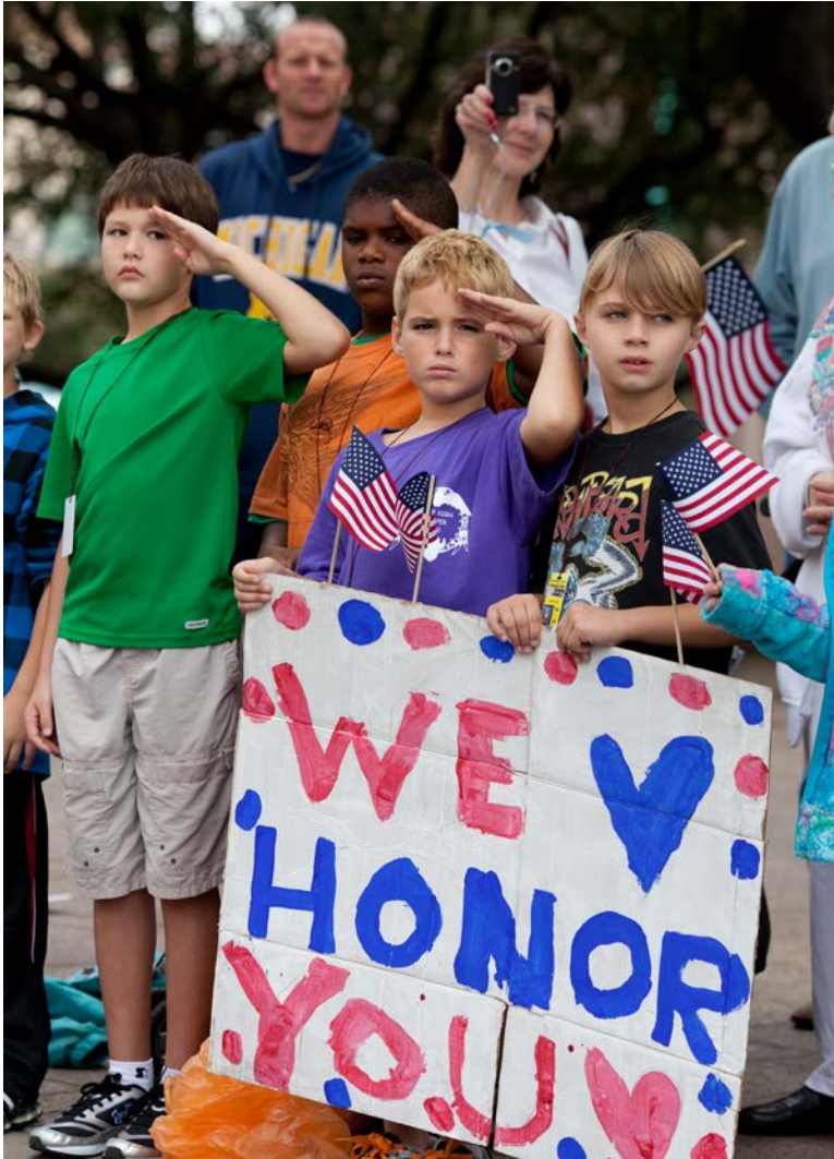
Students from the Texas School for the Deaf salute while watching a Veterans Day parade.

The next time November 11 rolls around, think about the veterans who help defend you and your country every day. Give thanks for their service and sacrifice.